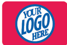
LEFT SIDE TREATMENT CORPORATE LOGO