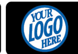
LEFT SIDE TREATMENT CORPORATE LOGO