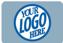
LEFT SIDE TREATMENT CORPORATE LOGO