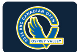
TOURNAMENT LOGO FULL FRONT CHEST