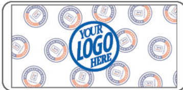
FRONT TREATMENT TOURNAMENT/ CORPORATE LOGO