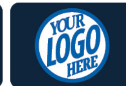
CORPORATE LOGO LEFT SLEEVE