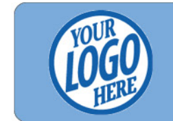
CORPORATE LOGO LEFT CHEST