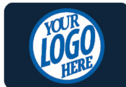
CORPORATE LOGO LEFT SLEEVE