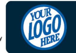
CORPORATE LOGO LEFT CHEST