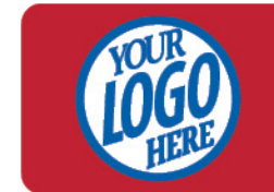
CORPORATE LOGO LEFT CHEST