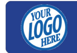
CORPORATE LOGO LEFT CHEST