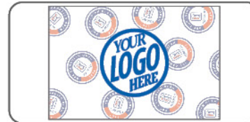
FRONT TREATMENT TOURNAMENT/ CORPORATE LOGO