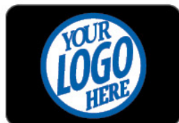
LEFT SIDE TREATMENT CORPORATE LOGO