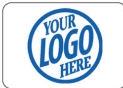
CORPORATE LOGO LEFT CHEST