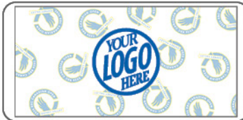
FRONT TREATMENT TOURNAMENT/ CORPORATE LOGO