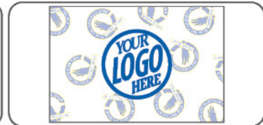
FRONT TREATMENT TOURNAMENT/ CORPORATE LOGO